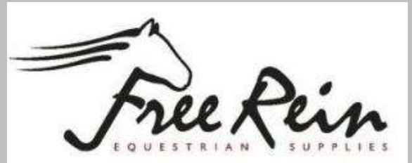
CTRL+CLICK ON THE LOGO ABOVE VISIT THE WEB SITE

Call Chemmart Lavington today on 02 6040 2204 and let them look after all of your health needs!