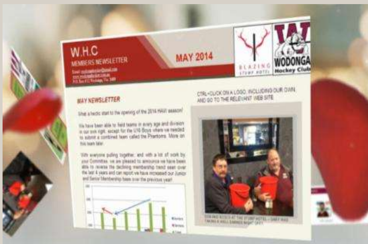
CTRL+CLICK ON THE IMAGE ABOVE AND WATCH THE THANK YOU VIDEO

Next season looks like it will be just as busy with the Committee already working on a number of new initiatives for 2015!!